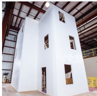
Trial 2: Fluid-Applied Membrane WRB-AB System