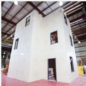
Trial 1: Building Wrap WRB-AB System