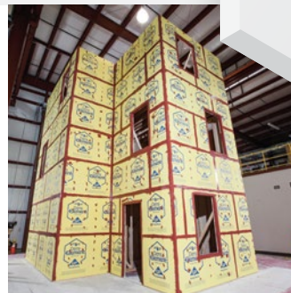
Trial 3: DensElement® Barrier System

The results presented reflect the findings on specific construction assemblies, under test conditions. Actual results may vary depending on the system, the building, the installation methods, and other factors.